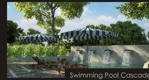
Swimming Pool Cascade