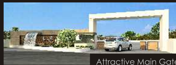
Attractive Main Gate