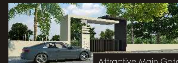
Attractive Main Gate